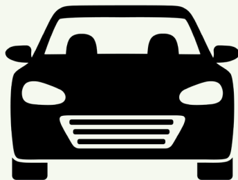
Number of car vehicles in the fleet